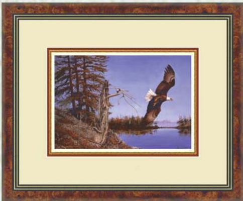
G9-3907 "Dare To Fly" by Richard Plasschaert, a Federal Duck Stamp competition winner and also the winner of numerous State Duck Stamp competitions. This piece is triple acid free conservation matted with gold fillet. Frame is wood/burl finish w/gold highlighted edge. Framed size is 19" x 23".