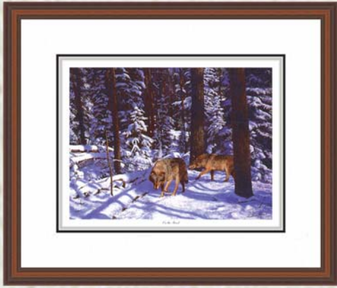
G9-3903 "On The Prowl" by Richard Plasschaert, a Federal Duck Stamp competition winner and also the winner of numerous State Duck Stamp competitions. This piece is triple acid free conservation matted w/hand wrapped linen. Frame is wood/highlighted walnut finish. Framed size is 23" x 27".