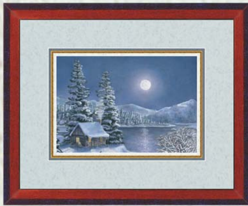
G9-9259 "Winter Hideaway" by Bill Haas, an Internationally renowned artist who paints everything from landscapes to seascapes and contemporary to abstracts. This piece is triple acid free conservation matted with gold fillet. Frame is wood/mahogany cascade finish. Framed size is 19" x 23".