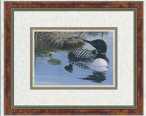
G9-9300 "Loon" by Gary Fenske, an internationally recognized artist for his wildlife portraiture and seascapes. This piece is triple acid free conservation matted with gold fillet. Frame is wood/burl finish w/gold highlighted edge. Framed size is 19" x 23".