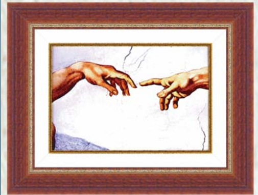
G9-3902 "The Hands of God & Man" by Michelangelo, one of the world's Great Old Masters. This piece is a lithograph print transferred onto canvas. Frame is wood/sienna finish w/gold highlighted edge, linen lining & gold fillet. Framed size is 15" x 19".