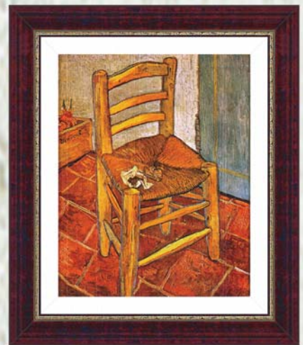
G10-4004 "The Chair and the Pipe" by Vincent Van Gogh, one of the world's Great Old Masters. This piece is a lithograph print transferred onto canvas. Frame is wood/mahogany finish w/gold highlighted edge & a linen lining. Framed size is 18" x 22".