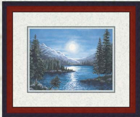
G10-4009 "Enchanted Moonlight" by Bill Haas, an internationally renowned artist who paints every thing from landscapes to seascape and contemporary to abstracts. This piece is triple conservation matted. Frame is wood with a mahogany cascade finish. Framed size is 22" x 26".