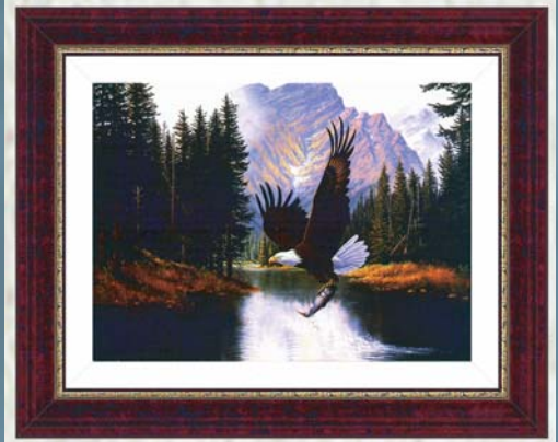
G10-4003 "Mountain Majesty" by Derk Hansen, a renowned German-born artist whose talents are dedicated to wildlife & the Old West. This piece is a lithograph print transferred onto canvas. Frame is wood/mahogany finish w/gold highlighted edge & a linen lining. Framed size is 18" x 22".