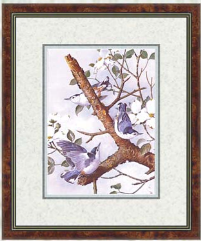
G10-4008A "White-Breasted Nuthatch" by Basil Ede, widely regarded as one of the foremost painters of birds in the world today; his oriental exposure is reflected in his work. This piece is triple conservation matted. Frame is wood/burl finish w/gold highlighted edge. Framed size is 21" x 25".