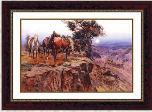
G14-4402 "Innocent Allies" by Charles Russell, an early American Western artist. This piece is a lithograph print transferred onto canvas. Frame is wood/mahogany finish w/gold highlighted edge, linen lining & gold fillet. Framed size is 20" x 27".