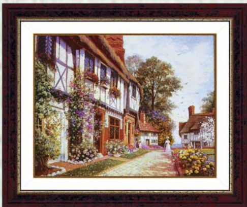
G14-4405 "Promenade of Flowers" by Thelma Leaney Butler, internationally renowned, of British decent, paintings are exclusively of English countryside & city scenes. This piece is a lithograph print transferred onto canvas. Frame is wood/mahogany finish w/gold highlighted edge, linen lining & gold fillet. Framed size is 22" x 26".