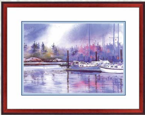
G14-2006 "Summer Cove" by Gary Spetz, a contemporary award winning artist specializing in landscapes and seascapes. This signed & numbered limited edition print is triple acid free conservation matted. Frame is wood/mahogany cascade finish. Framed size is 28" x 35".