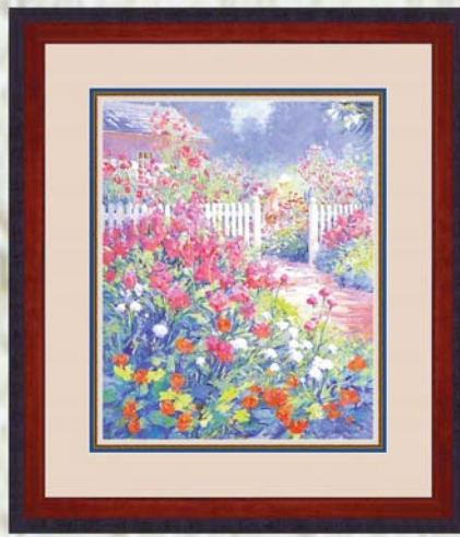
G14-4401 "Pink Garden House" by Ron McKee, bold authoritative Strokes of color characterize his impressionistic style. Subject matter includes western, landscape and contemporary. This piece is triple acid free conservation matted w/gold fillet. Frame is wood/mahogany cascade finish. Framed size is 27" x 31".