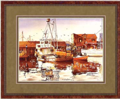
G16-4606 "Marina Reflections" by LaVere Hutchings N.W.S., an artist with over 2600 different paintings of seascapes in private & public collections. This piece is triple conservation matted w/suede & gold fillet. Frame is wood/burl finish w/gold highlighted edge. Framed size is 28" x 34".