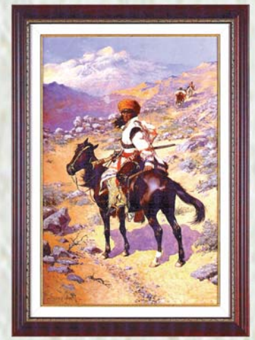
G16-4603 "An Indian Trapper" by Frederic Remington, an early American Western artist. This piece is a lithograph print transferred onto canvas. Frame is wood/mahogany finish w/gold highlighted edge, linen lining & gold fillet. Framed size is 26" x 36".