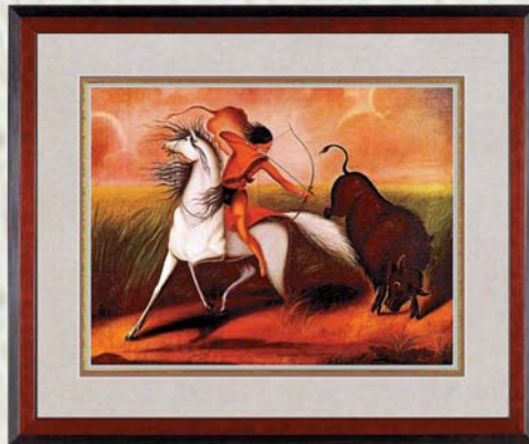
G16-4608 "Buffalo Hunter (1830)" by an Unknown American. This piece is triple conservation matted w/suede & gold fillet. Frame is wood/mahogany cascade finish. Framed size is 29" x 35".