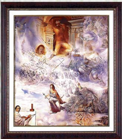
G16-4604 "Ecumenical Council" by Salvador Dali, a 20th Century Master of multi-faceted symbolism. This piece is a lithograph print transferred onto canvas. Frame is wood/mahogany finish w/gold highlighted edge, linen lining & gold fillet. Framed size is 30" x 34".