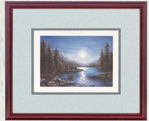
M2-8256 "Enchanted Moonlight" by Bill Haas, an Internationally renowned artist who paints everything from landscapes to seascapes and contemporary to abstracts. This piece is double acid free conservation matted. Frame is wood with rosewood finish. Framed size is 12" x 13".