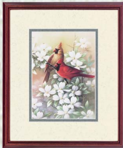
M2-8016 "Flowers And Birds" by T.C. Chiu, a renowned China-born artist. His work is a combination of traditional realism and contemporary painting techniques. This piece is double acid free conservation matted. Frame is wood with rosewood finish. Framed size is 12" x 13".