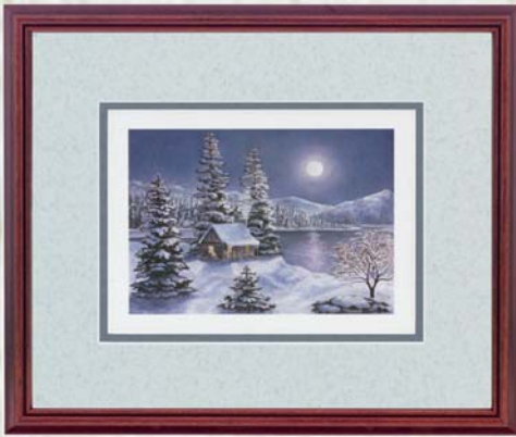
M2-8258 "Winter Hideaway" by Bill Haas, an Internationally renowned artist who paints everything from landscapes to seascapes and contemporary to abstracts. This piece is double acid free conservation matted. Frame is wood with rosewood finish. Framed size is 12" x 13".