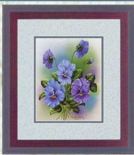
M6-8513 "Pansies" by Crystal Skelley, an internationally renowned artist known for the realism displayed in her paintings of florals, birds & their habitat. This piece is double acid free conservation matted. Frame is wood with mahogany cascade finish. Framed size is 16" x 18".