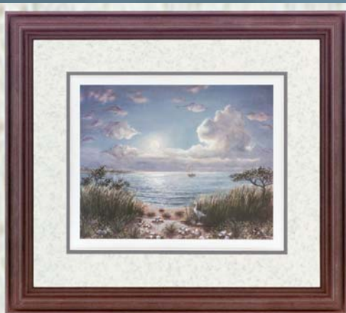
M6-8761 "A Moonlit Sail" by Bill Haas, an Internationally renowned artist who paints everything from landscapes to seascapes and contemporary to abstracts. This piece is double acid free conservation matted. Frame is wood with rosewood finish. Framed size is 16" x 18".