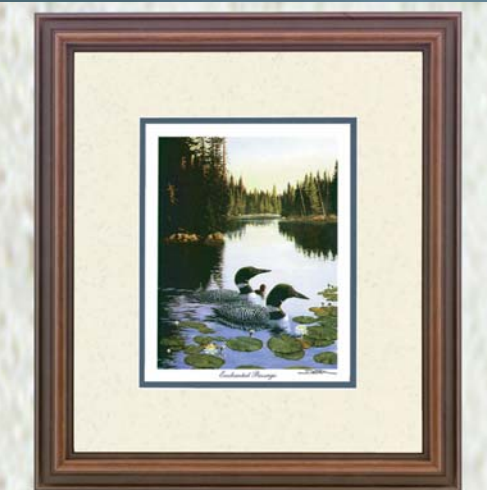
M6-3508 "Enchanted Passage" by Derk Hansen, a renowned German-born artist whose talents are dedicated to wildlife & the Old West. This piece is double acid free conservation matted. Frame is wood with highlighted walnut finish. Framed size is 16" x 18".