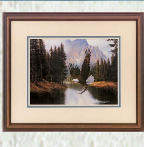
M10-4003 "Mountain Majesty" by Derk Hansen, a renowned German-born artist whose talents are dedicated to wildlife & the Old West. This piece is triple conservation matted with suede. Frame is wood with a highlighted walnut finish. Framed size is 21" x 25".