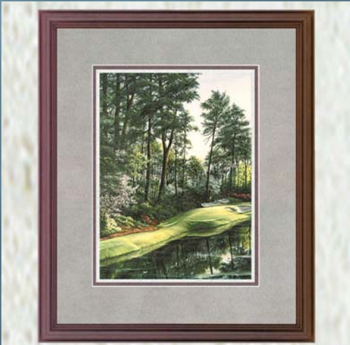
M10-9509 "12th Hole @ Augusta National" by Crystal Skelley, an internationally renowned artist known for the realism displayed in her paintings of landscapes, florals, birds & their habitat. This piece is triple conservation matted with suede. Frame is wood with a rosewood finish. Framed size is 21" x 25".